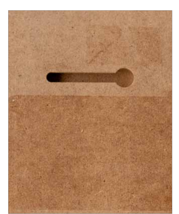
FIG 4 FIG 5